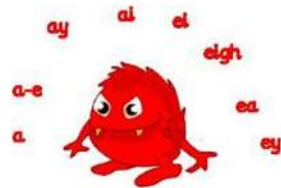
Angry Red A