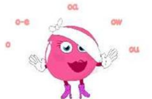
Miss Oh No