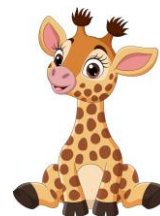
Geraldine the Giraffe