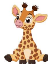
Geraldine the Giraffe