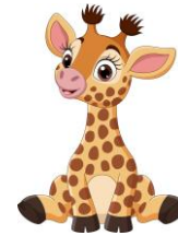
Geraldine the Giraffe