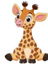
Geraldine the Giraffe

Well done to Miss Simpkin's class in EYFS for attaining 100% attendance in week 9. Amazing!