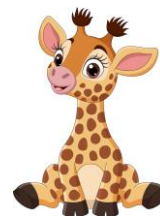
Geraldine the Giraffe