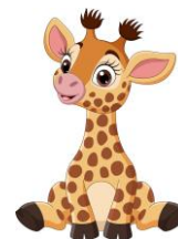
Geraldine the Giraffe